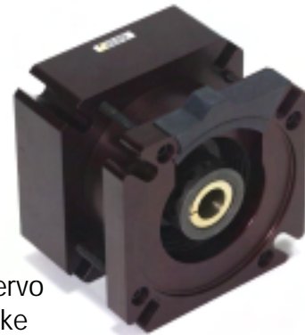
Eclipse Servo Motor Brake

Nexen was able to solve this company’s problem by installing the new Eclipse Servo Motor Brake. Eclipse utilizes a flange-mounted design that includes so many options it can fit virtually every servo motor. Out of the box, the Eclipse solution can be mounted between the servo motor and the NEMA-flanged, worm gear reducer on the lift and rail systems of the gantry robot. The output end of the size 4 & 5 Eclipse brakes are supplied with a NEMA shaft, pilot flange and bolt circle to mount directly to 56TC or 145TC worm gear reducer. Both input and output flanges have slotted bolt holes that allow easy bolt installation and provide a range of bolt circle diameters. These are standard products!